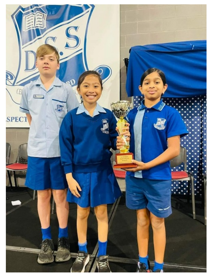
The Cleaners Award for the cleanest classroom in Week 10 has been awarded to