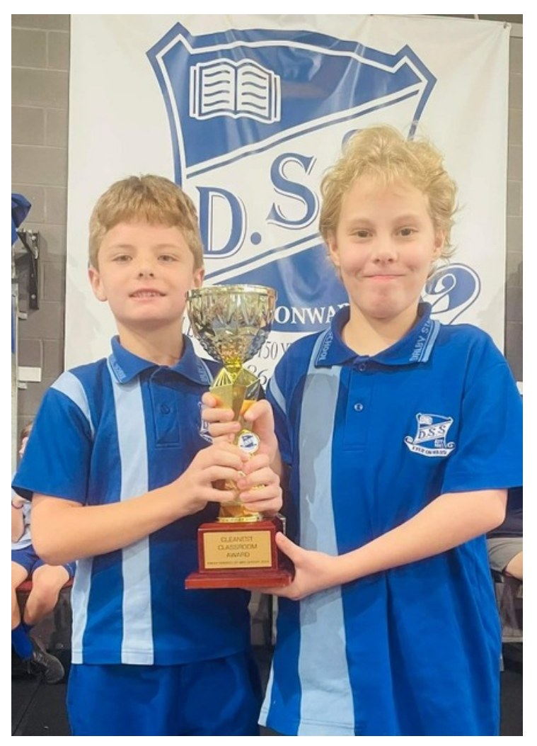
The Cleaners Award for the cleanest classroom in Week 1 has been awarded to